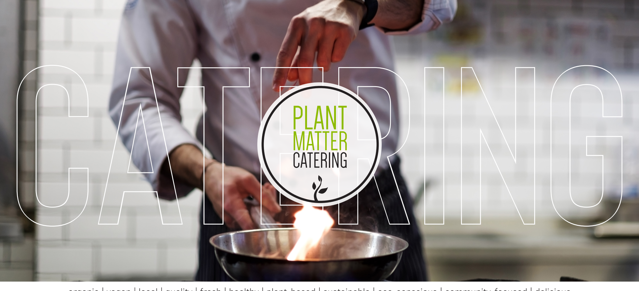
organic | vegan | local | quality | fresh | healthy | plant-based | sustainable | eco-conscious | community-focused | delicious